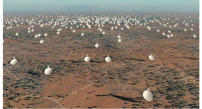
Fig2. An artist vision of the SKA Core site, with some of the projected 3000 15-meter parabolic dishes. From http://www.skatelescope.org . Together with several million so-called aperture array antennas alike employed in (e.g. LOFAR), the core with receptors along networks of three arms stretching out to hundreds of kilometres, constitute a data intense and high performance compute exa-scale level ICT based infrastructure.

forms of passive cooling, plus room temperature operation, will be considered for the work of the Low Noise Amplifiers of the antenna sensors. Therefore, to extract the maximum scientific potential and maintain costs at appropriate levels it is essential to couple the power cycles with electronic power requirements (power and cooling), in a hot, dry site, with temperatures closer to 50°C in open field for viable operation.